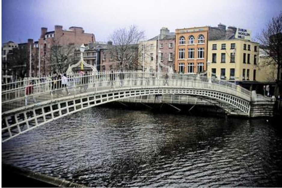
Ha'Penny Bridge in Dublin