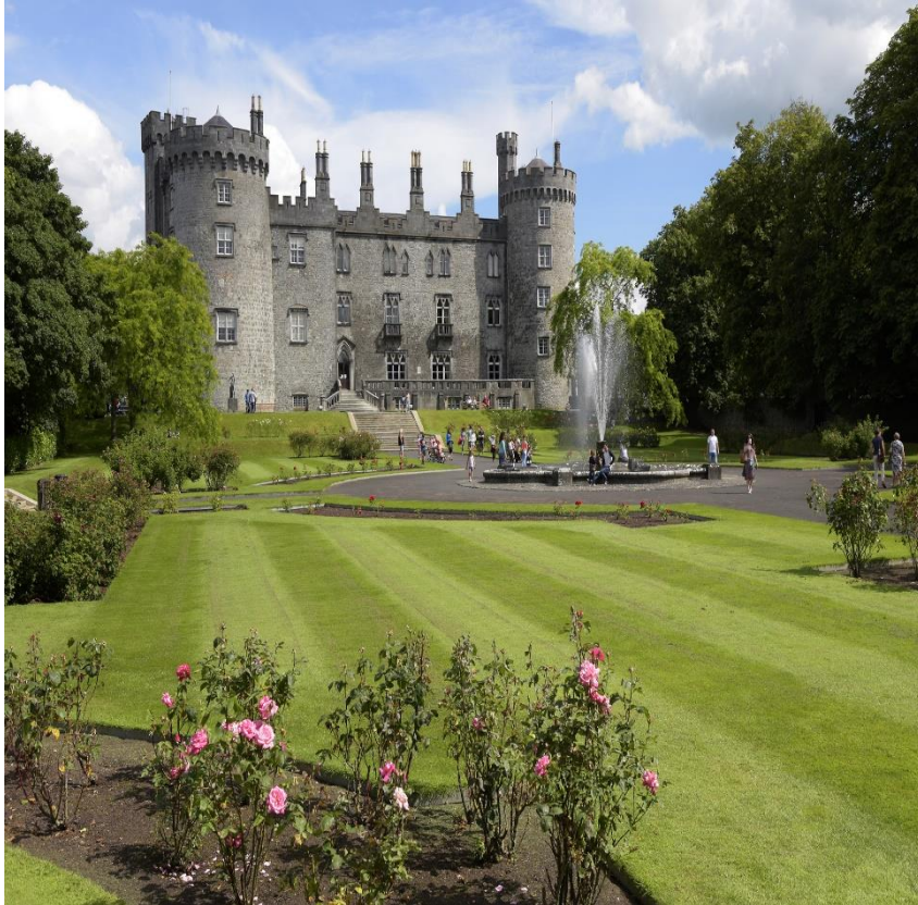
The Castle in Kilkenny