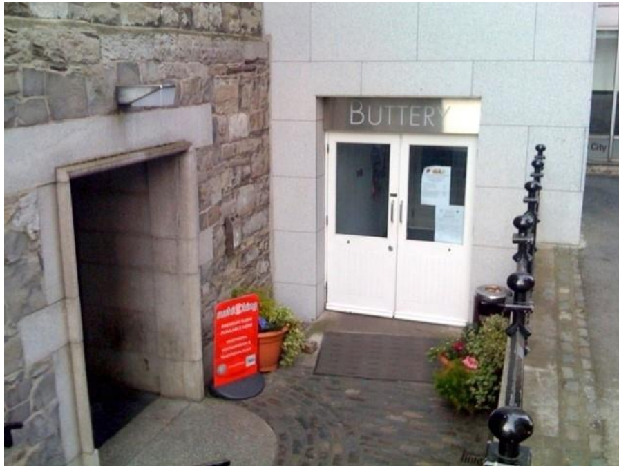
The Buttery where Breakfast and Lunch are Served