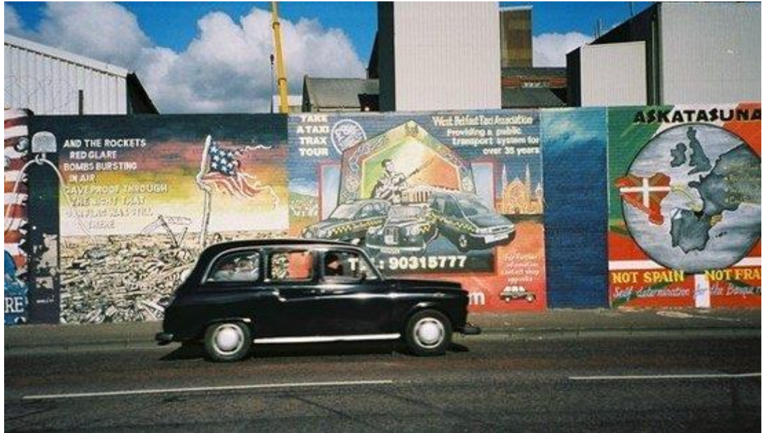
Belfast Black Taxi Tour