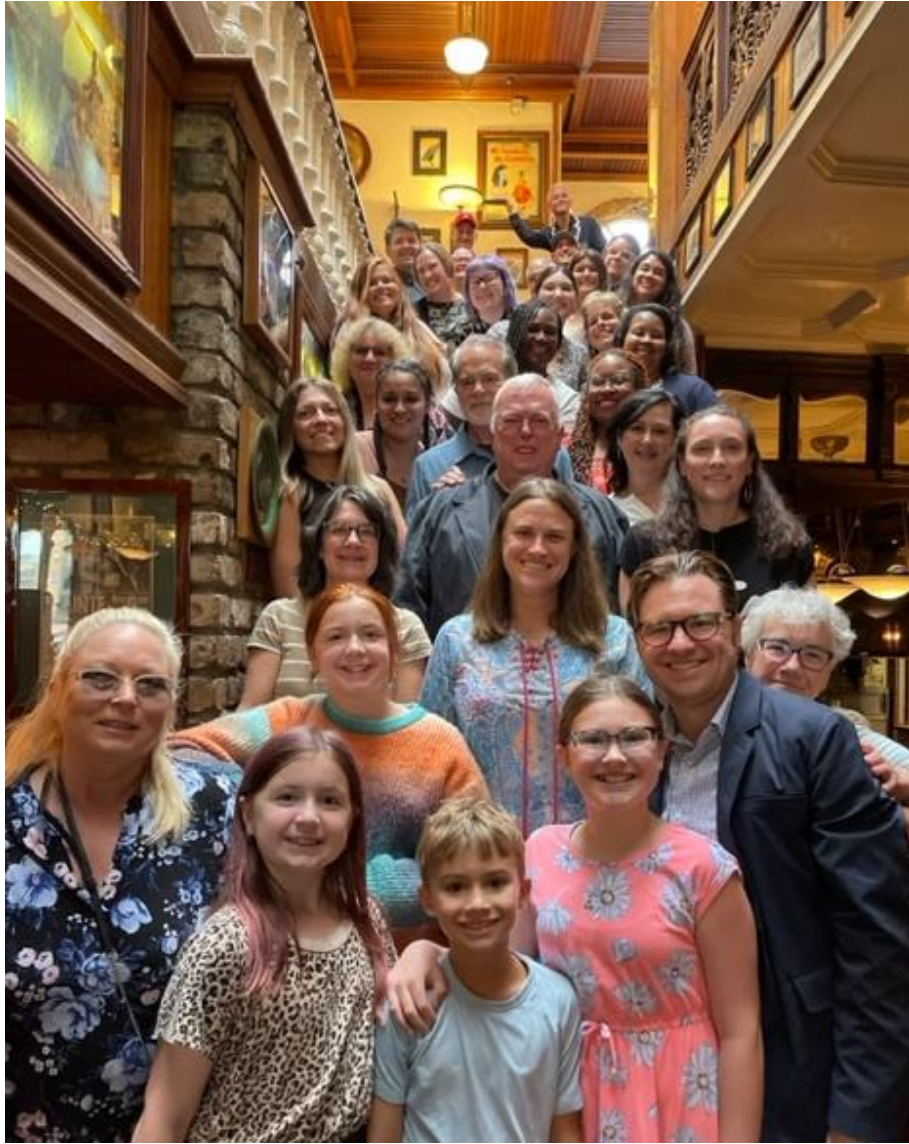
Participants in the 2023 Ireland Institute