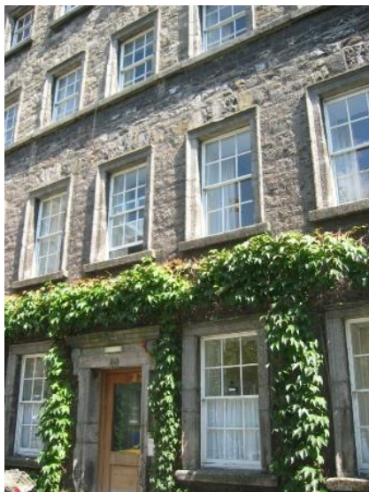
Botany Bay where Participant Apartments are Located