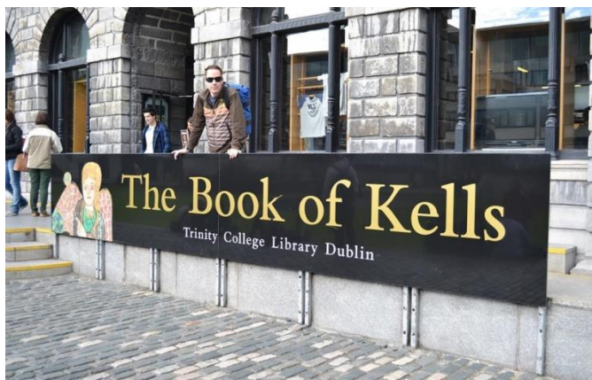
The Book of Kells located on the Campus of Trinity College

Seeing Ireland or Other Countries Before or After the Institute: Since round trip airfare from the United States to the airport in Dublin is individually arranged, participants may travel to Dublin early and join the group at Trinity College the day the institute begins. Participants also may stay over after the institute ends if they wish to further explore Ireland or other parts of Europe on their own. Those who stay afterwards may choose to return home from a city other than Dublin. Generally, airfare prices are not more expensive if you fly into one city and country and out of another. Short inexpensive one-way flights to countries close to Ireland and to other cities in Ireland can be purchased separately from tickets to/from Ireland or other European countries.