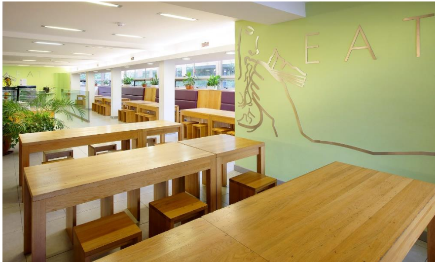
Inside the Buttery