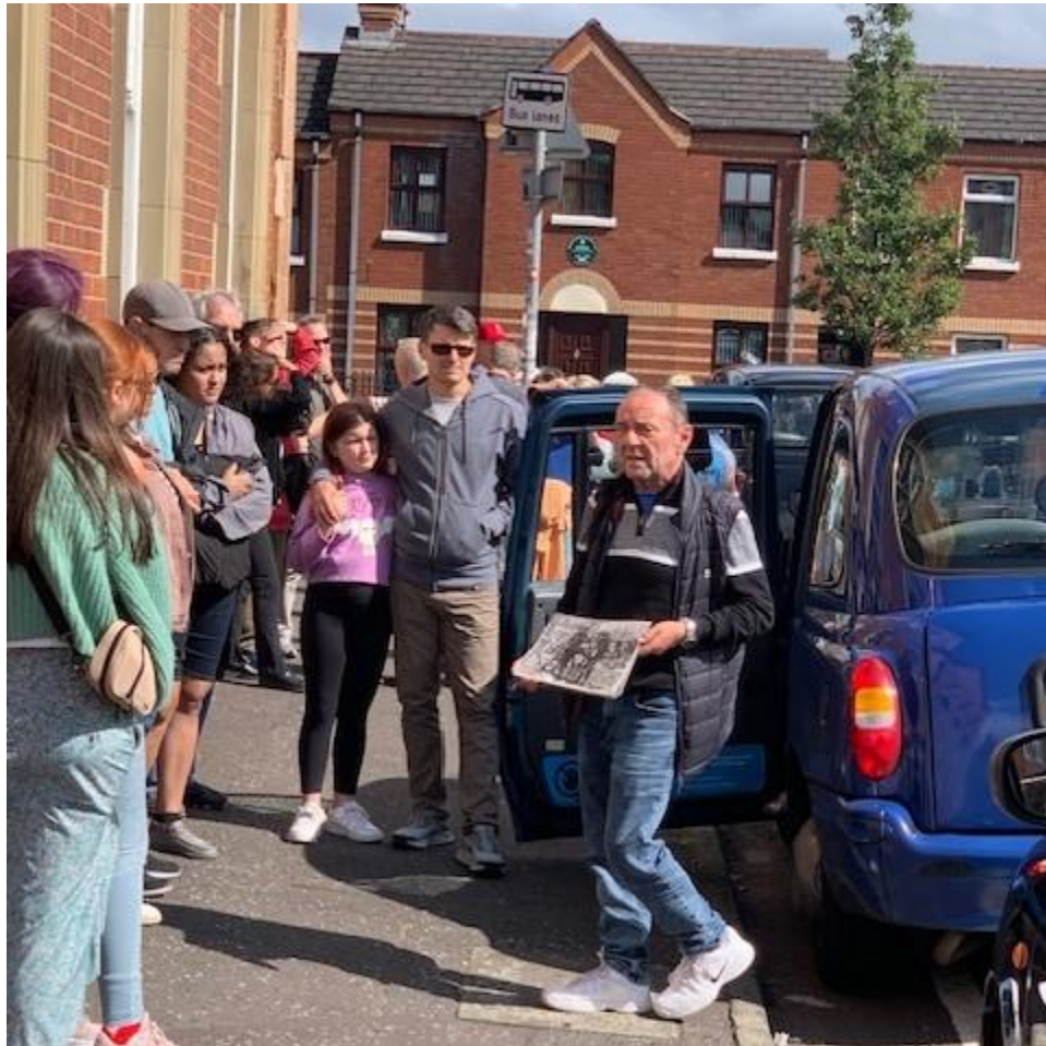
Participants on the Black Taxi Tour in Belfast, Northern Ireland