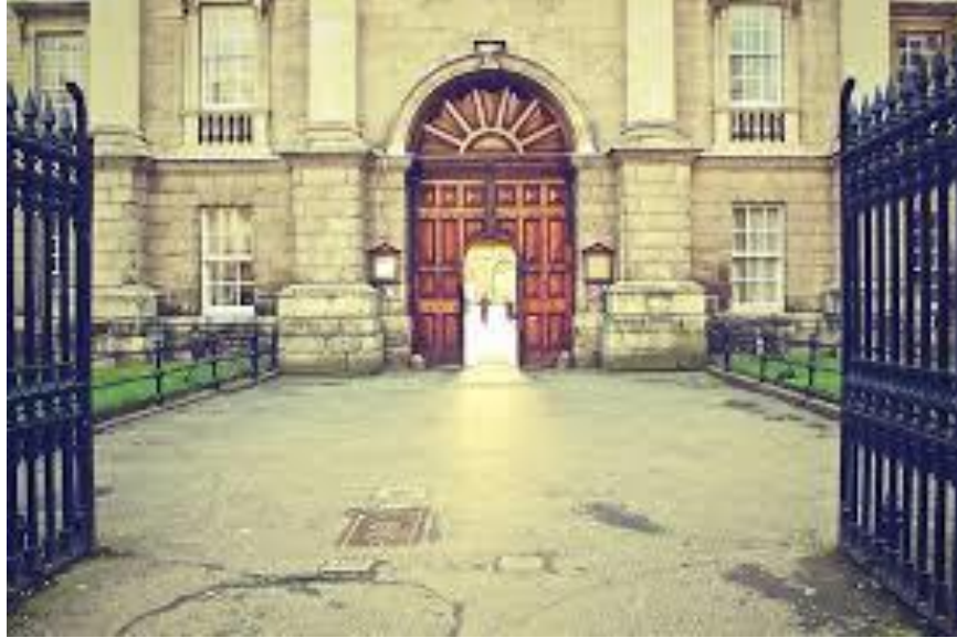
The Main Entrance to Trinity College in Dublin