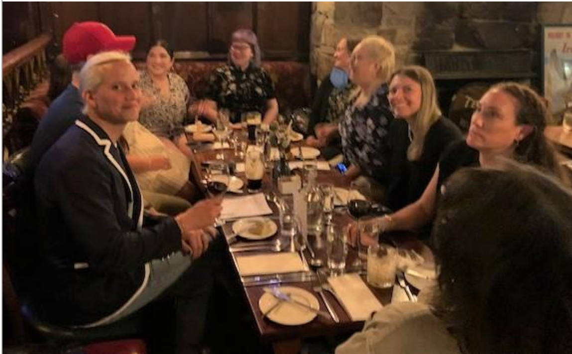
Participants at the Farewell Pub Dinner