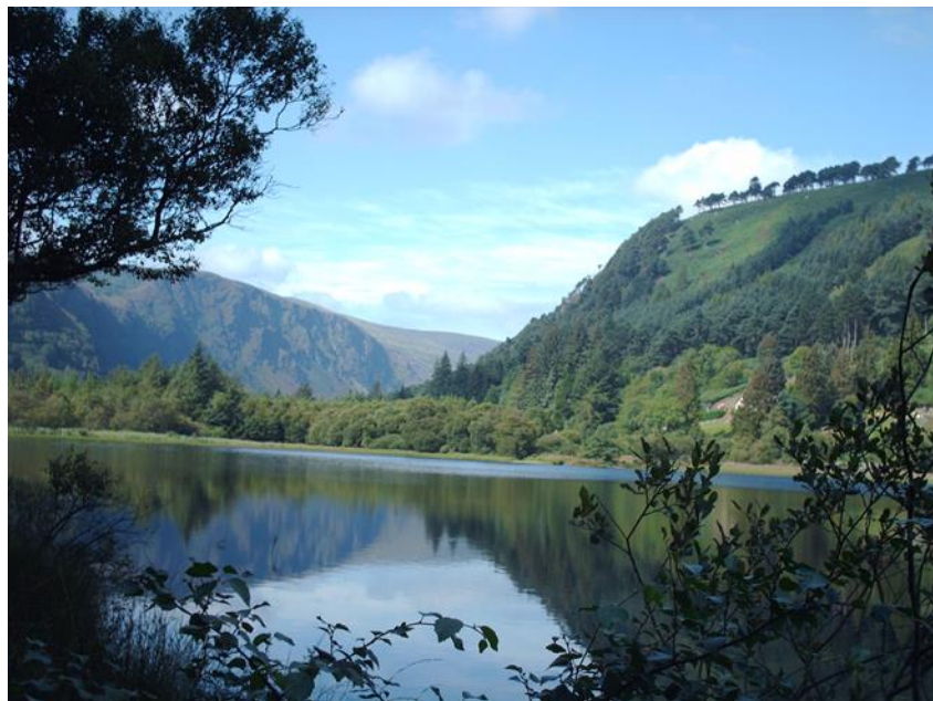
Lake at Glendalough