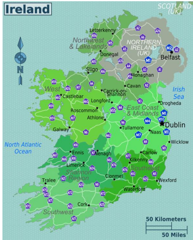
Map of Ireland