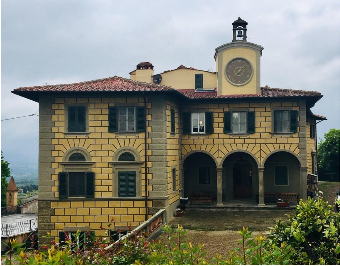
Casa Cares near Reggello, Italy See http://www.casacares.it