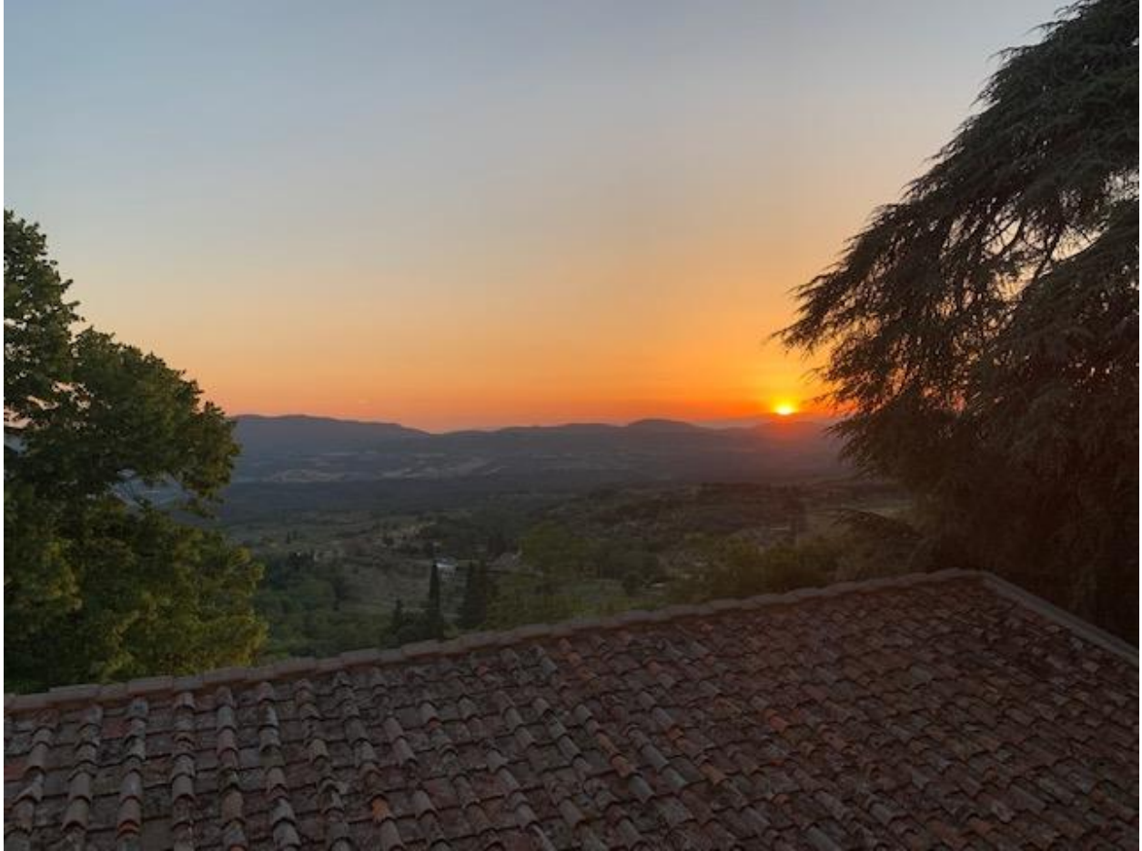
The Beautiful Sunset At Casa Cares