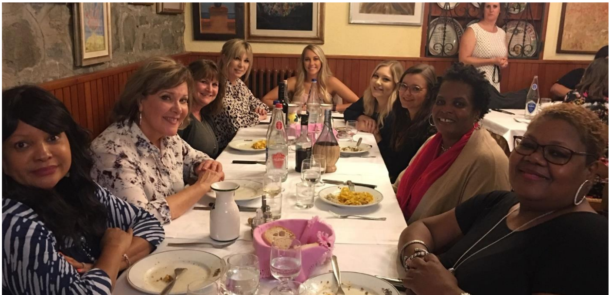
Participants at Ristorante Archimede