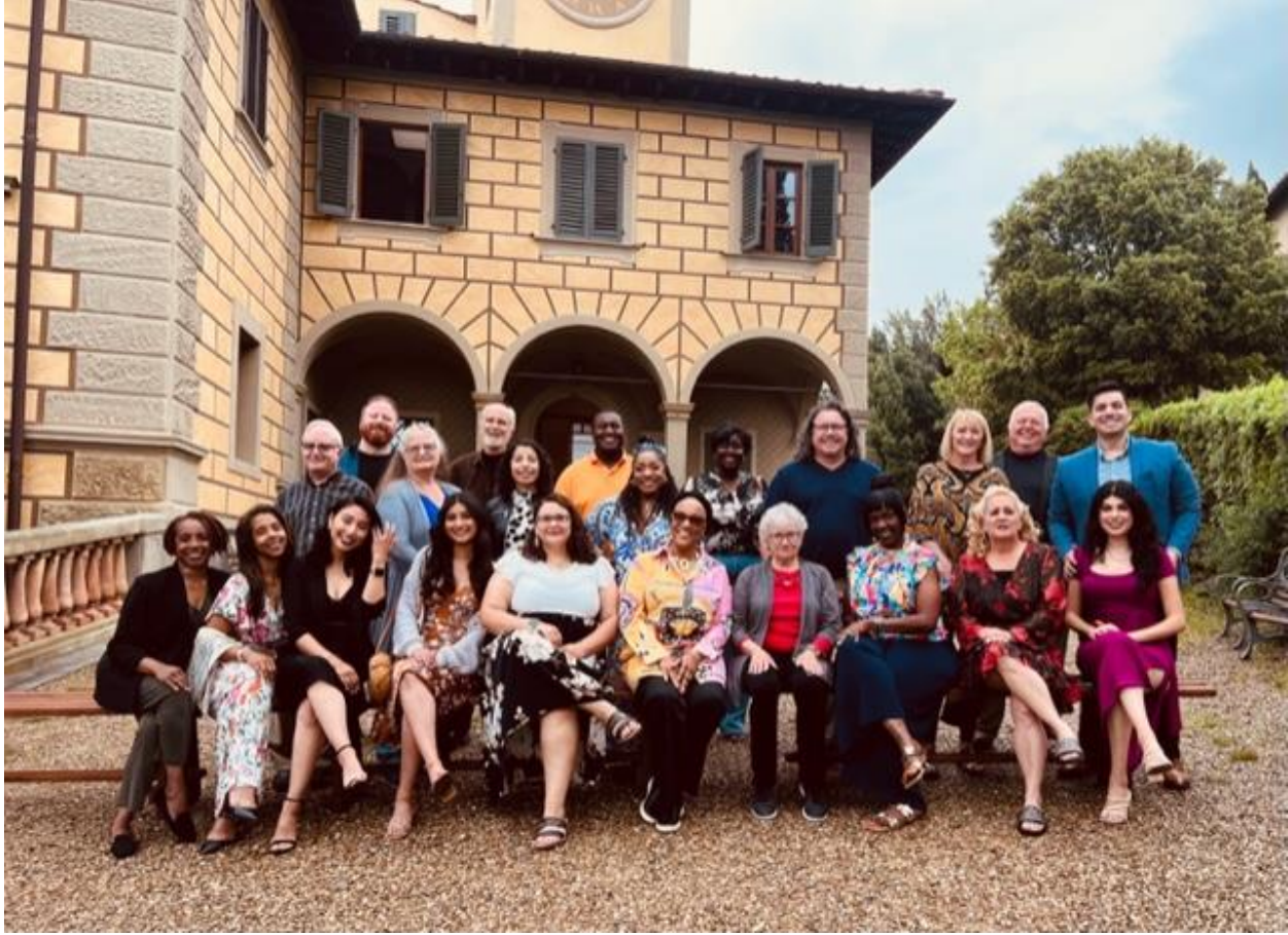
Participants at the second 2023 Institute