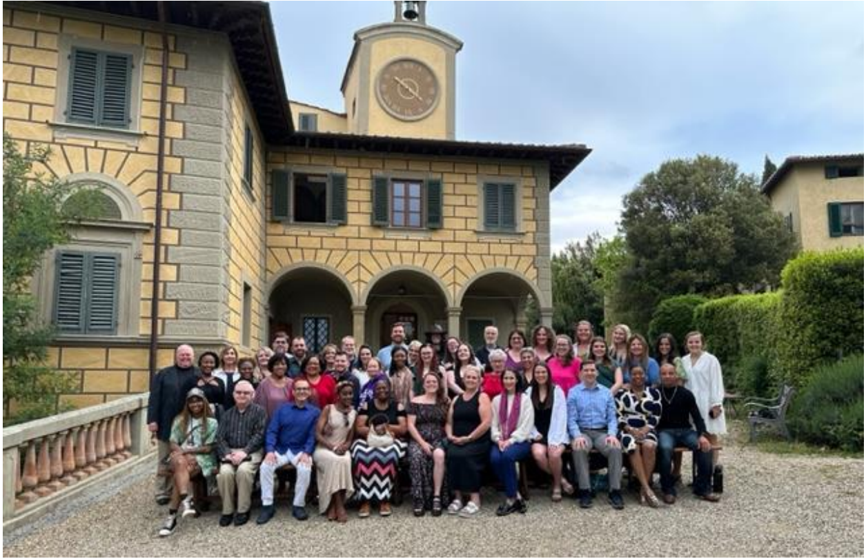
Participants at the first 2023 Institute