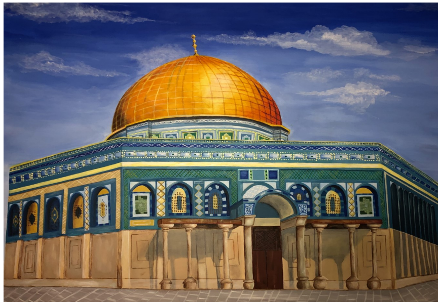
The Dome of the Rock