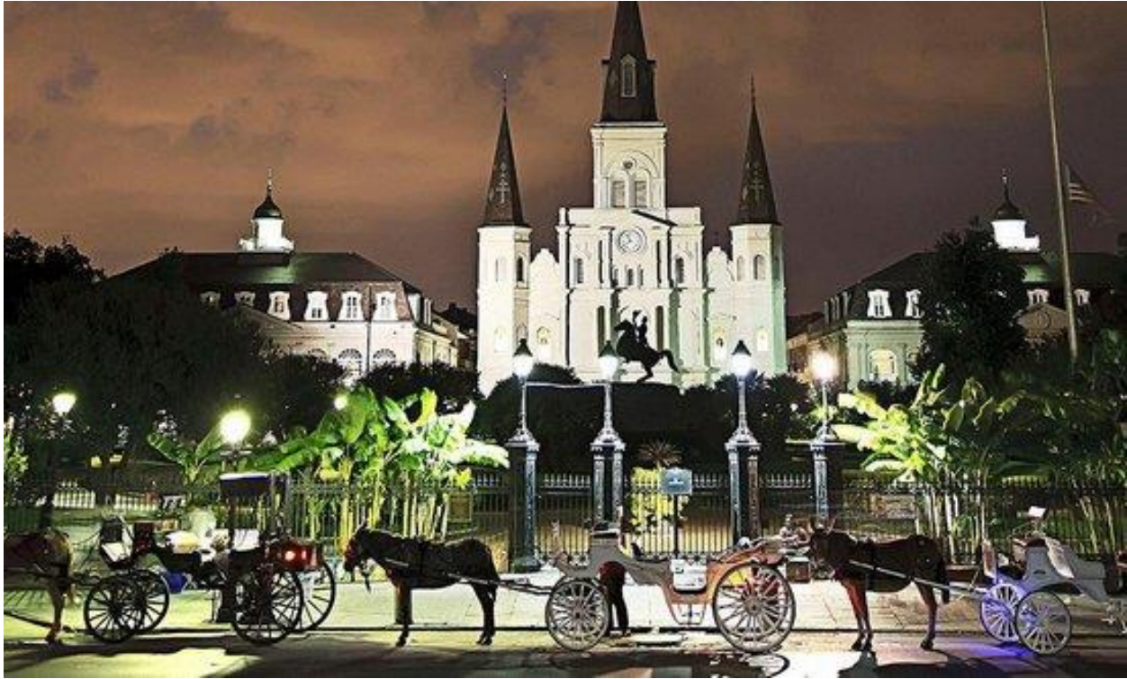
St. Louis Cathedral in Jackson Square located steps away from the Bourbon Orleans Hotel