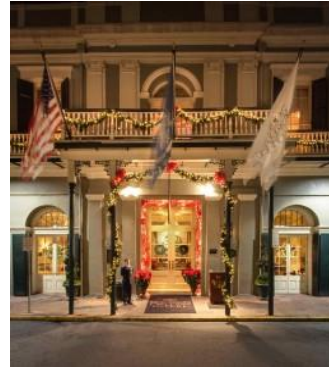
Bourbon Orleans Hotel