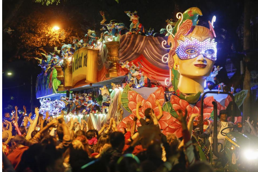
Mardi Gras Parade