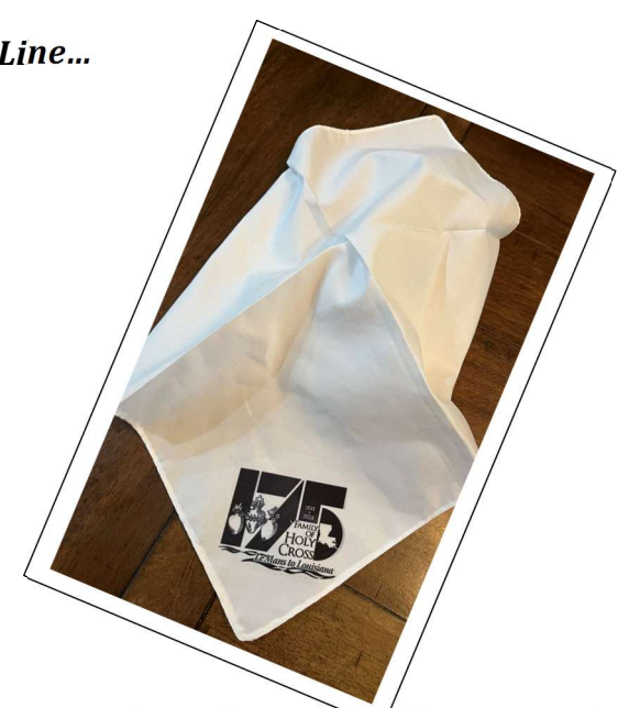
The Family gathered back at Holy Cross for a reception; a "Family Reunion" on many levels.