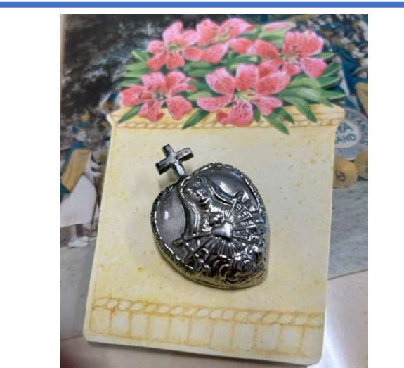
The Silver Heart... worn by the Marianites following vows. It is the symbol of Our Lady of Sorrows.

The Main Building included tall ceilings, outside gallery doors and transoms into the corridors to take advantage of the breezes coming off the river. The two wings were not added to the building until 1912, though they were part of the 1895 plans. The new building included classrooms, dorms, a chapel and a dining room.