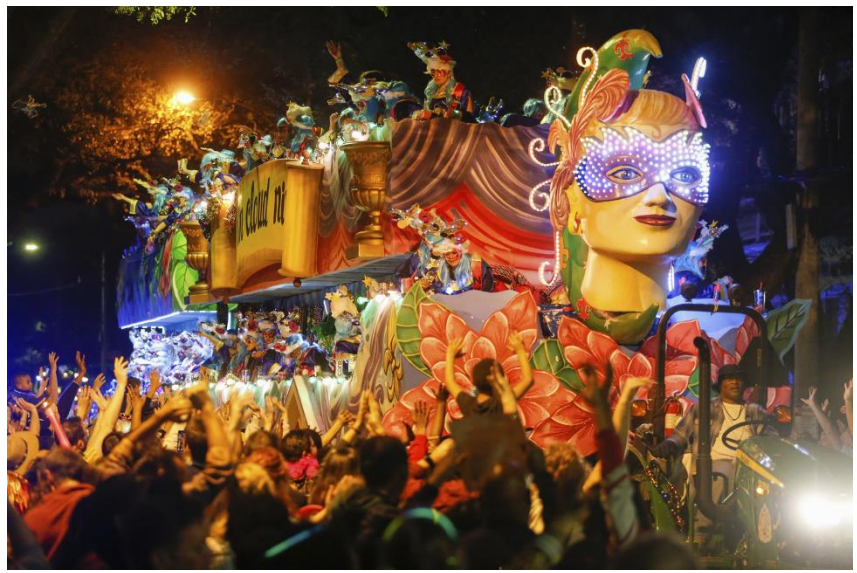
Mardi Gras Parade