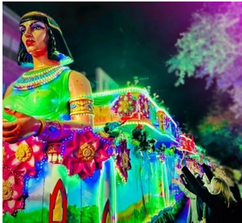
Krewe of Cleopatra Parade