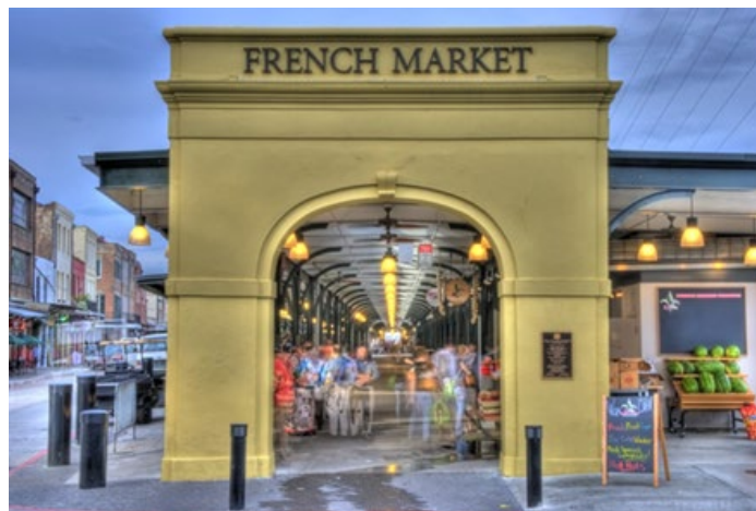
St. Louis Cathedral in Jackson Square and the famous French Market located steps away from the Bourbon Orleans Hotel.