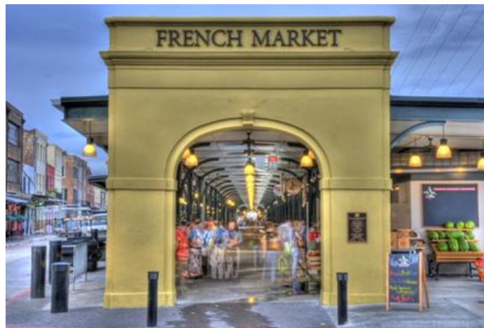
St. Louis Cathedral in Jackson Square and the famous French Market located steps away from the Bourbon Orleans Hotel.