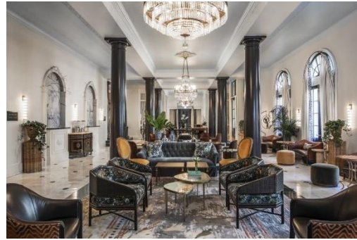
Bourbon Orleans Hotel www.bourbonorleans.com