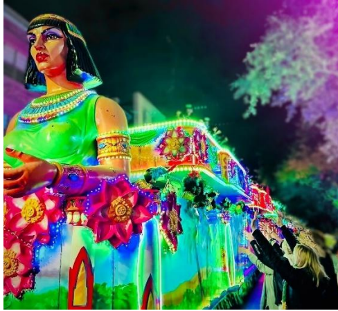
Krewe of Cleopatra Parade