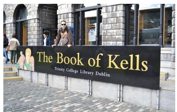
The Book of Kells located on the Campus of Trinity College

Seeing Ireland or Other Countries Before or After the Institute: Since round trip airfare from the United States to the airport in Dublin is individually arranged, participants may travel to Dublin early and join the group at Trinity College the day the institute begins. Participants also may stay over after the institute ends if they wish to further explore Ireland or other parts of Europe on their own. Those who stay afterwards may choose to return home from a city other than Dublin. Generally, airfare prices are not more expensive if you fly into one city and country and out of another. Short inexpensive one-way flights to countries close to Ireland and to other cities in Ireland can be purchased separately from tickets to/from Ireland or other European countries.