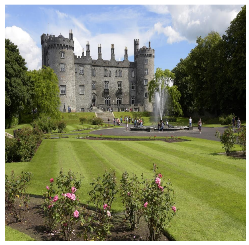
The Castle in Kilkenny