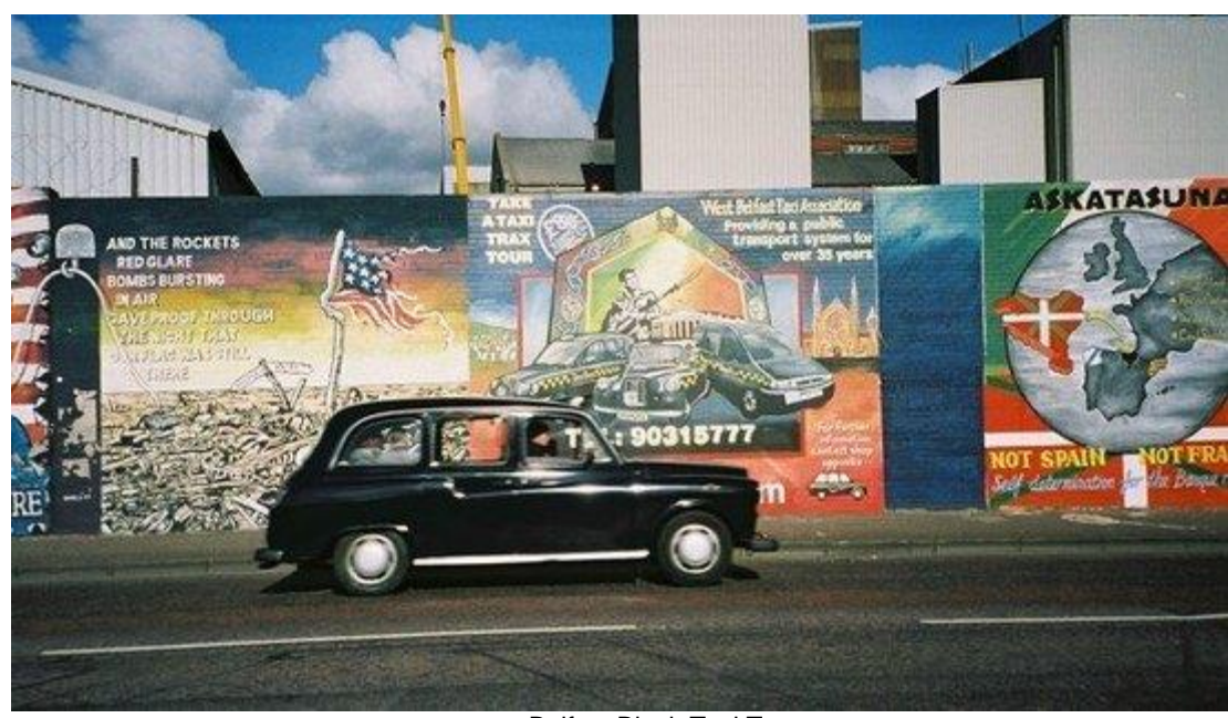
Belfast Black Taxi Tour