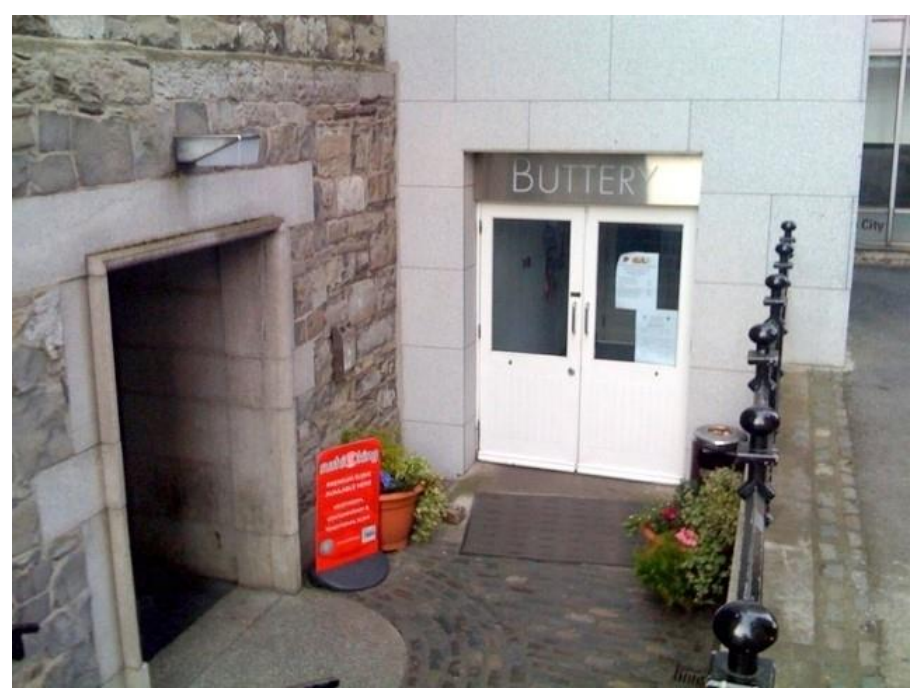
The Buttery where Breakfast and Lunch are Served