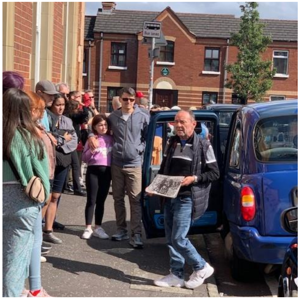
Participants on the Black Taxi Tour in Belfast, Northern Ireland