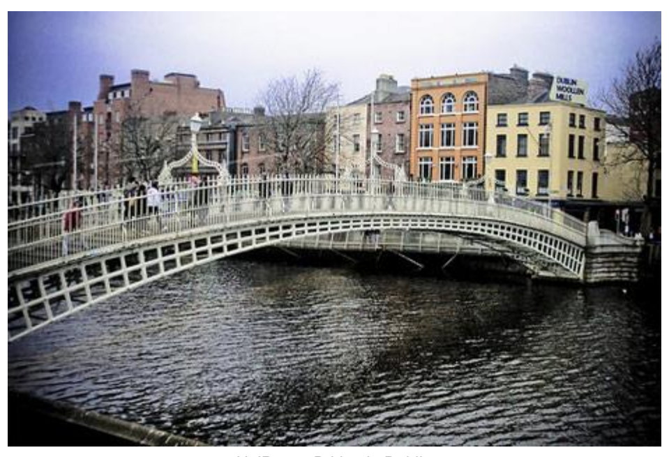
Ha'Penny Bridge in Dublin