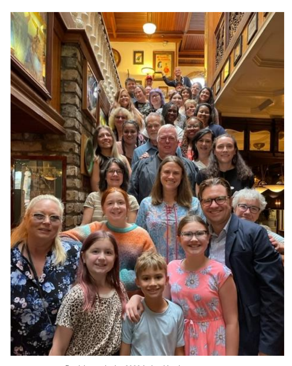
Participants in the 2023 Ireland Institute