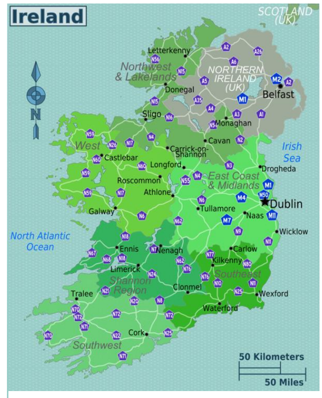
Map of Ireland