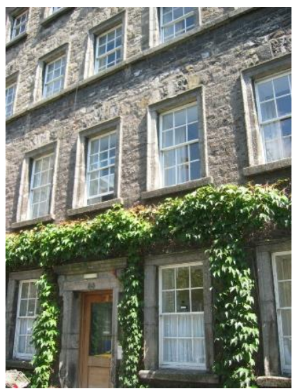
Botany Bay where Participant Apartments are Located