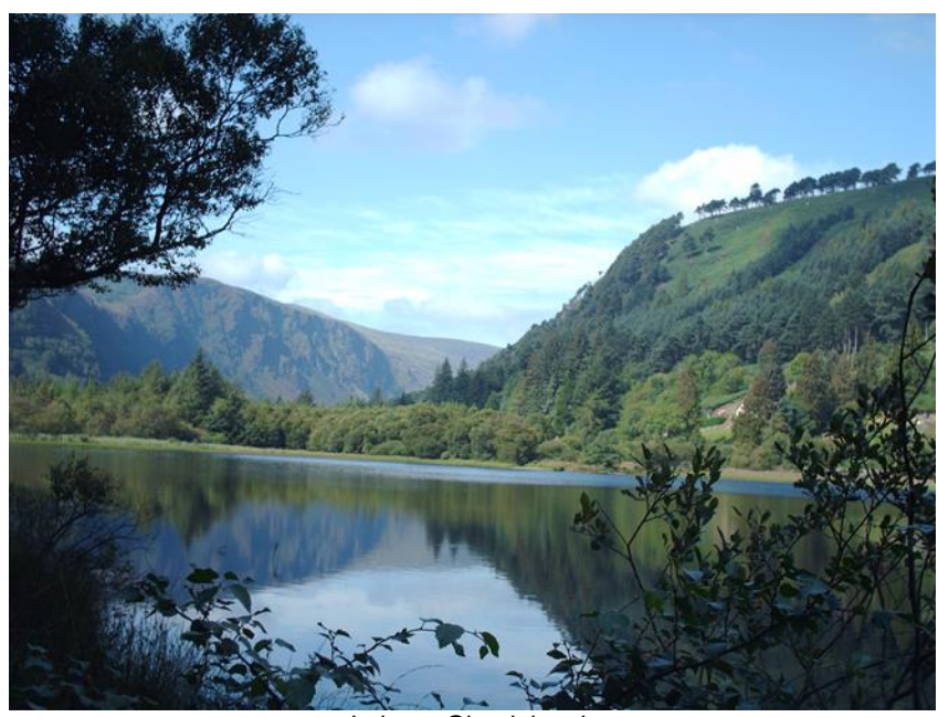
Lake at Glendalough