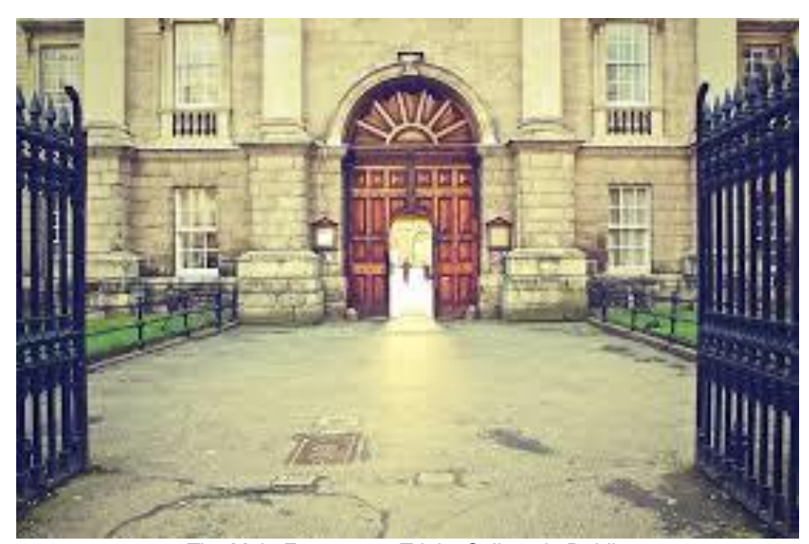
The Main Entrance to Trinity College in Dublin