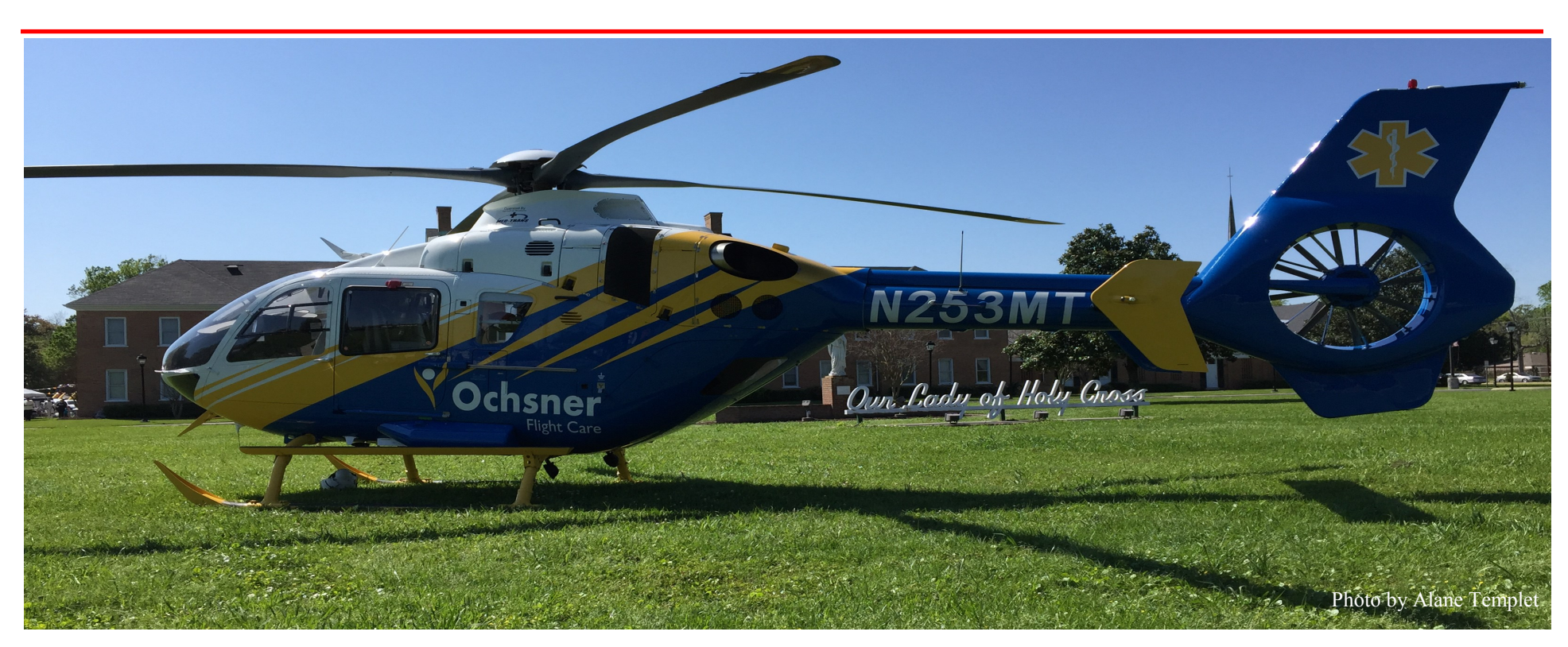
Ochsner Helicopter Drops In During Easter Extravaganza

Student Newspaper at Our Lady of Holy Cross College New Orleans, Louisiana Spring 2015